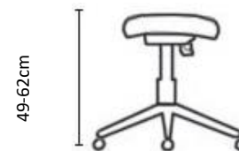
Sit/Stand PU Stool (With Footring)